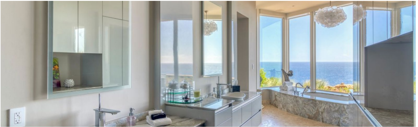
The primary bathroom has dual vanities, a soaking tub and an outdoor shower. OIL NUT BAY