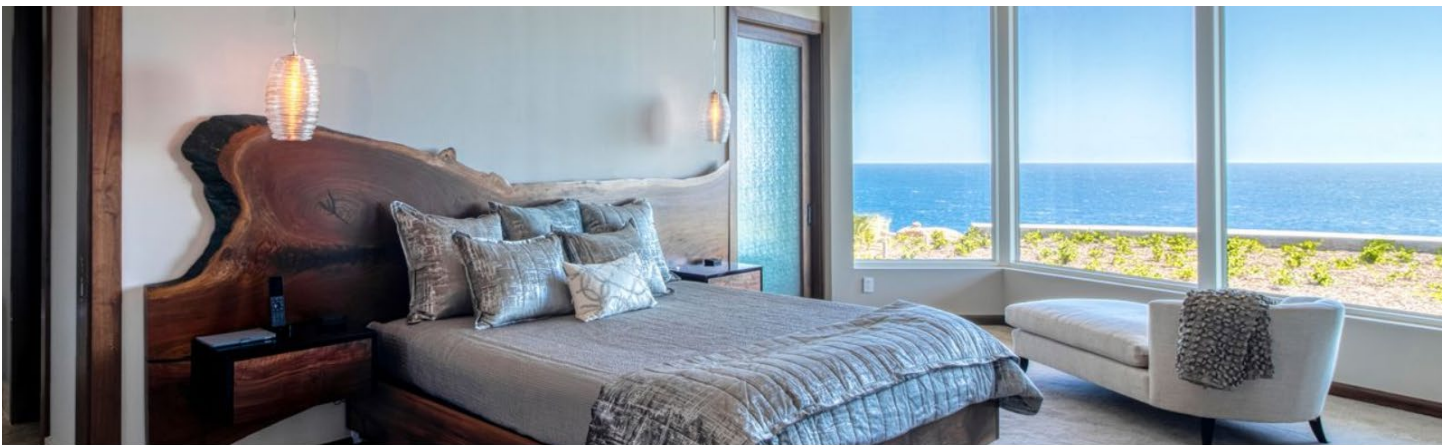
Halo, the 8,021-square-foot main villa, has five bedrooms, six full bathrooms and one partial bathroom. OIL NUT BAY