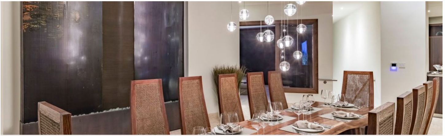
The dining room has a flowing water wall feature. OIL NUT BAY