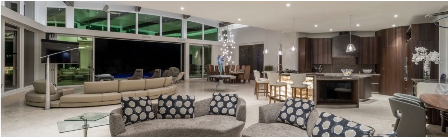
The expansive great room features palatial 18-foot ceilings, with 10-foot ceilings in the rest of the home. OIL NUT BAY