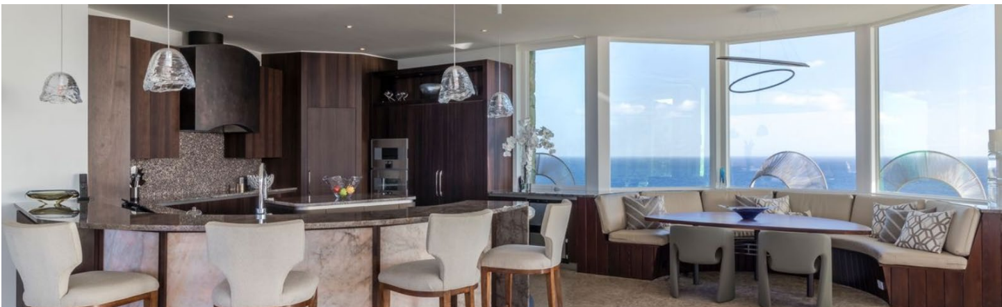
The open-concept chef's kitchen has custom Italian cabinetry and a walk-in pantry. OIL NUT BAY