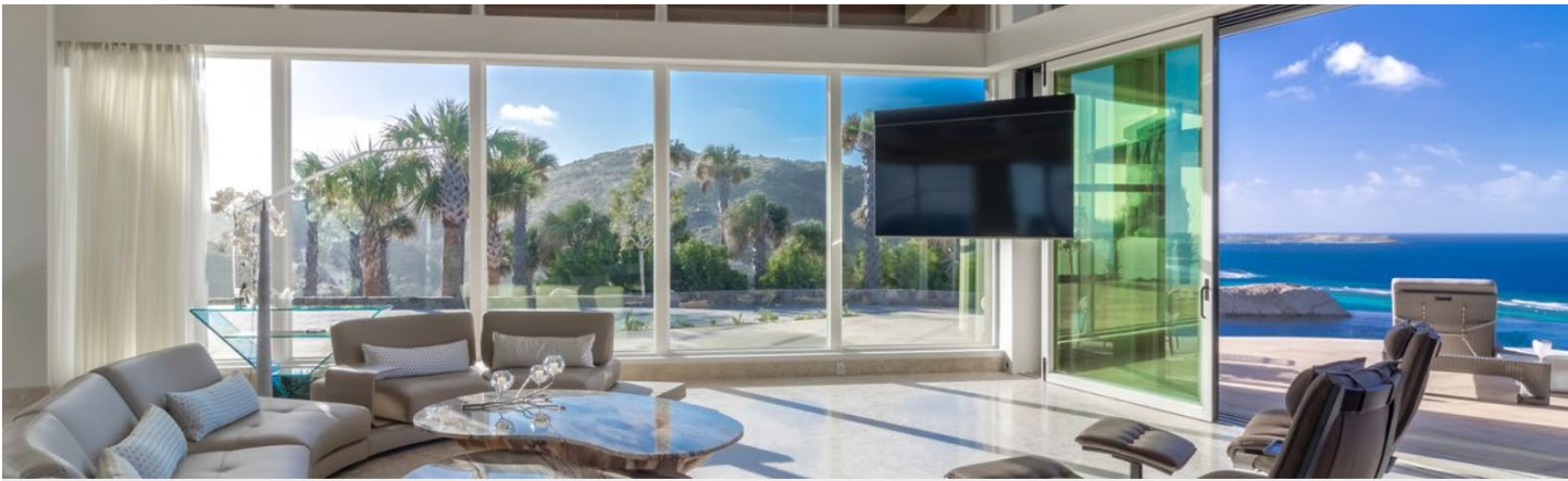
The contemporary main house, known as Halo, is designed so that the interior and exterior spaces blend seamlessly together, with towering walls of glass windows and doors on all sides t... OIL NUT BAY