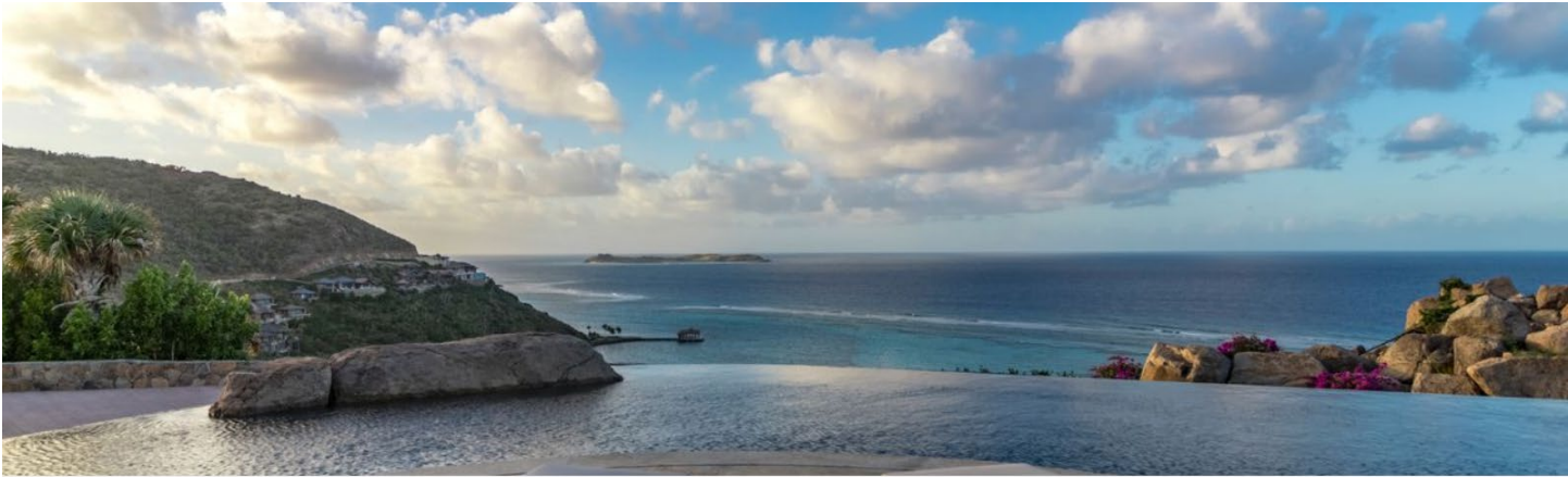
Amenities include an infinity-edge pool. OIL NUT BAY