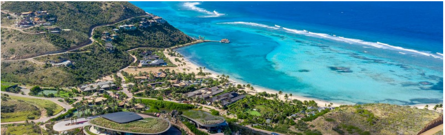
Aerial view of the two villas. OIL NUT BAY