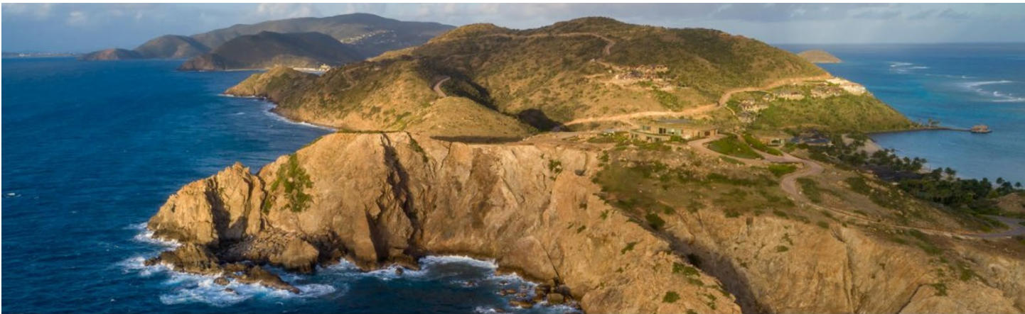
Made of native stone, steel and glass, the villa rises organically from the seaside cliffs. OIL NUT BAY